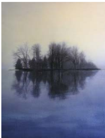
Leppendorf Shire Floating Island

Many corporations have their own art collections and purchase art for diverse reasons. A corporation may decide to acquire artwork by local artists to support the local arts community. Corporations also purchase art for investment purposes and may display these acquisitions in their public spaces for their employees and customers to enjoy. While all types of art are collected, works that are non-controversial are usually those most displayed. Businesses have been known to look for up-and-coming artists to add to their collection. This not only supports a talented artist and adds to the artist's credits, but helps the corporation acquire a beautiful piece of art at a great price that will hopefully increase in value in the future.