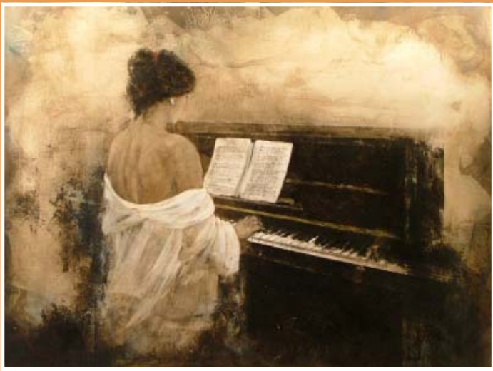
Original by Domenech 38 x 50"