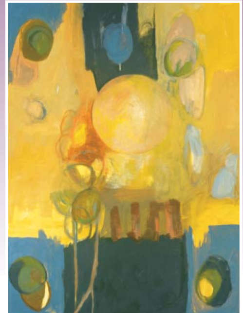
Freedom Series by Kollig

SMALL PACKAGES EXHIBIT IN 2 ND ROOM UNTIL CHRISTMAS