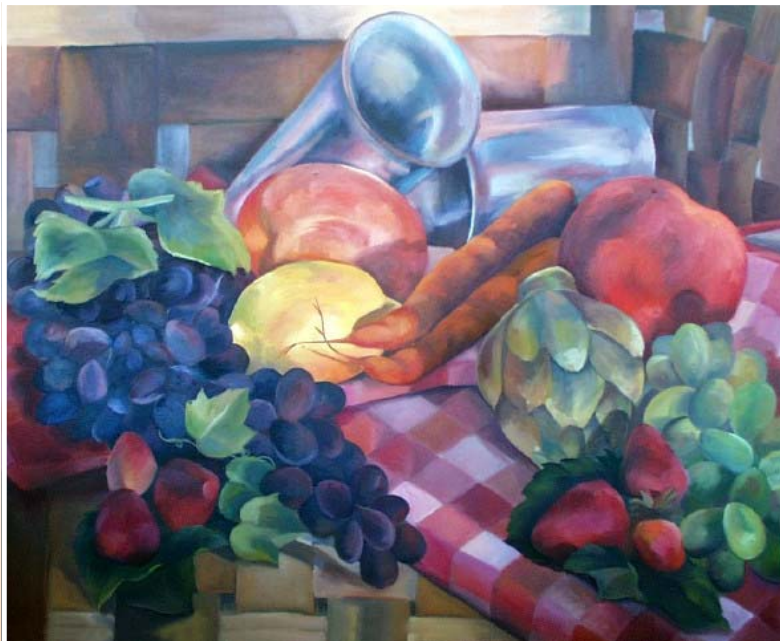
Untitled by Ashley Birkmaier