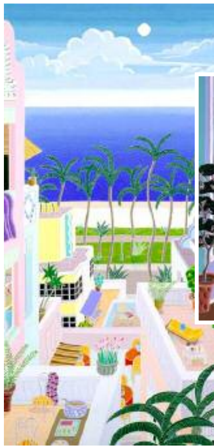
'Miami Beach 42' by Thomas McKnight* *Limited Edition Silkscreens